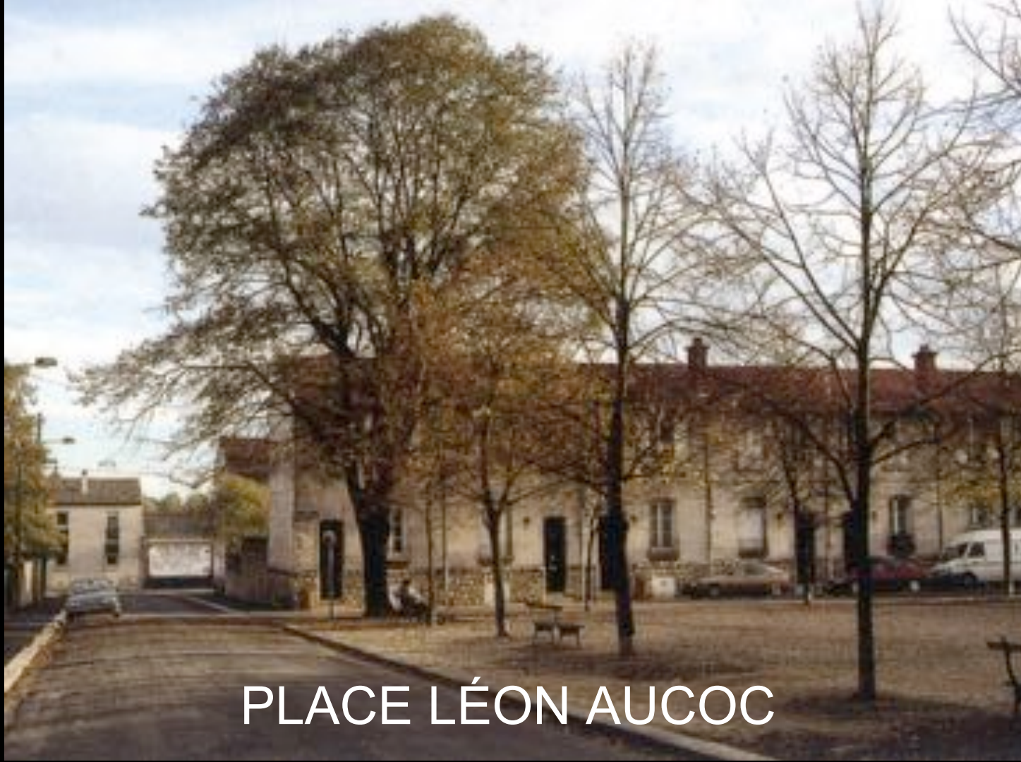
PLACE LÉON AUCOC