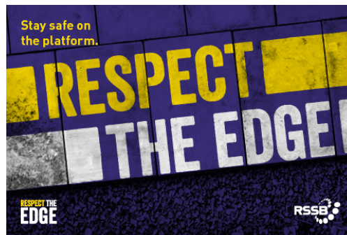
Poster from safety campaign in London Underground Rail Safety and Standards Board 2019

The Edge supports The Place Alliance and Teach the Future.